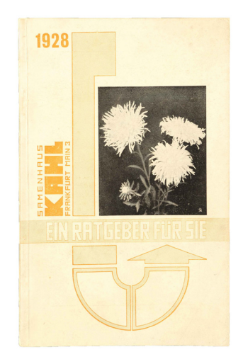
Product Catalogue: 1928