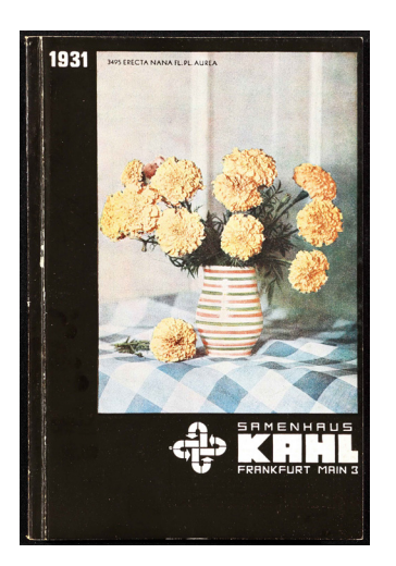
Product Catalogue: 1931